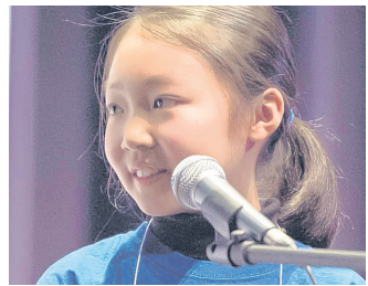
Chesterfield girl is spelling bee champion • B1

Cards phenom Perez starts spring with homer • C1